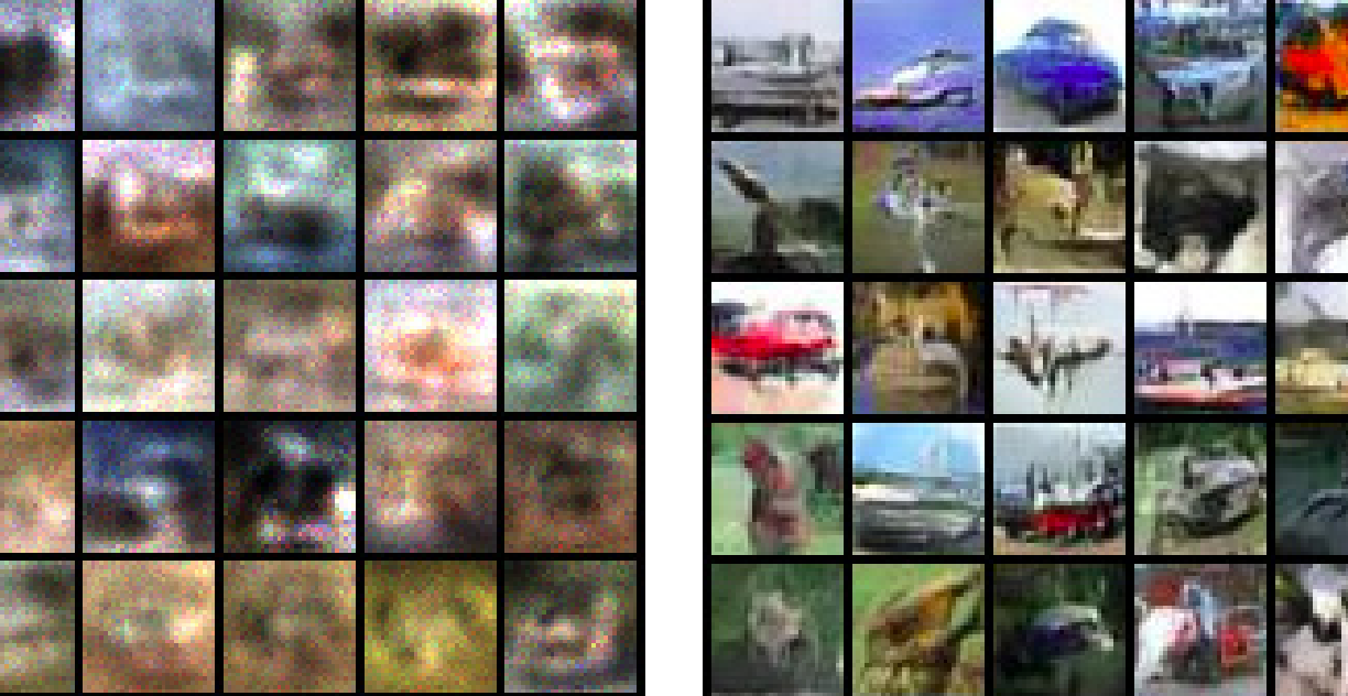
Figure 2: Artificial sample from GAN

The study confirmed the GAN is generating meaningful results first. Above images show that the synthesized images from later iteration (right) are improved from earlier iteration (left) for MNIST and CIFAR10 accordingly. Note that the objects generated on the CIFAR10 do improve visually with more clearly defined contour separated from background rather than a blob of colors. However, the details are still lacking for a human to classify the objects.